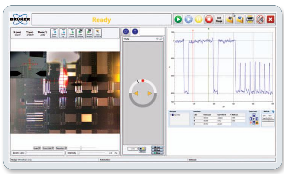
Vision64 Production Interface.

New software features make the Dektak XTL the most powerful, easiest to use stylus profiler available. The system utilizes Vision64 software that is fully compatible with Bruker's optical profiler line. The Vision64 software enables unlimited measurement sites, 3D mapping, and highly customized characterization with hundreds of built-in analysis tools. Also use Vision Microform software